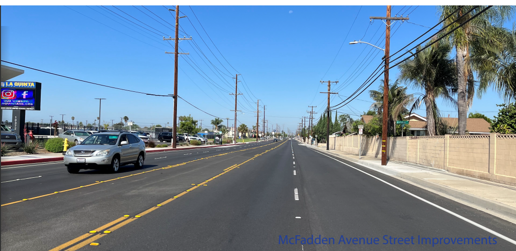
McFadden Avenue Street Improvements