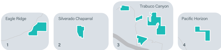
ENVIRONMENTAL MITIGATION PROGRAM PRESERVES