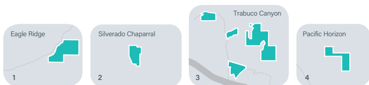
ENVIRONMENTAL MITIGATION PROGRAM PRESERVES