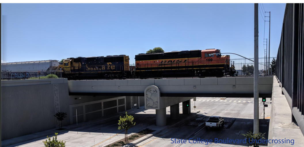
State College Boulevard Undercrossing