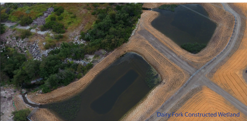
Dairy Fork Constructed Wetland