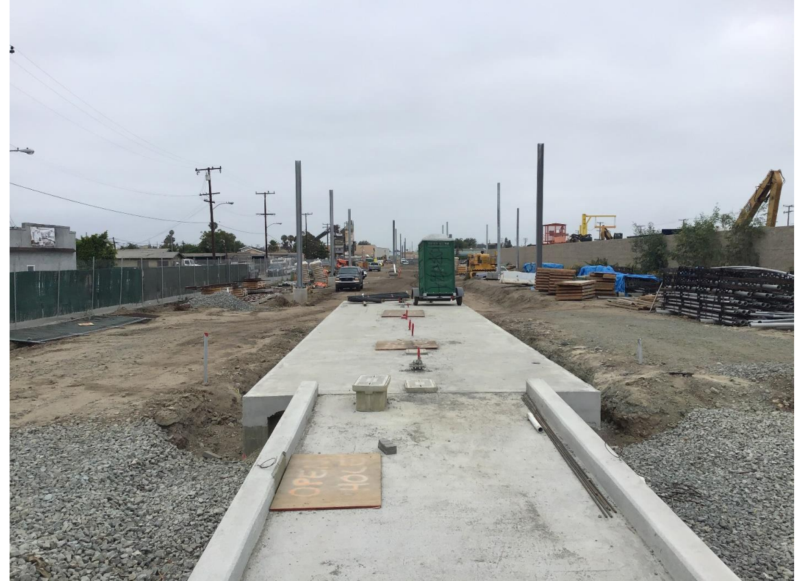
Raitt Station Stop