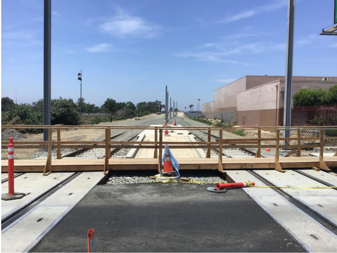
Fairview Crossing and Station Stop