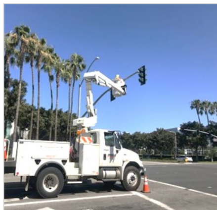
Irvine Center Drive/ Edinger Avenue City of Irvine

Project P funds awarded to date: $142.3 million