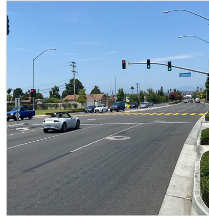
Brookhurst Street Improvements City of Anaheim