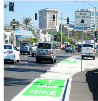
Newport Boulevard Improvements City of Newport Beach