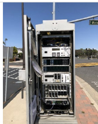
Seal Beach Boulevard/ Bolsa Avenue City of Seal Beach