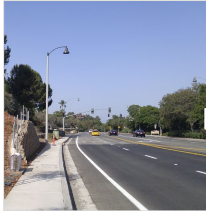
Del Obispo Improvements City of San Juan Capistrano

Project O funds awarded to date: $382.1 million