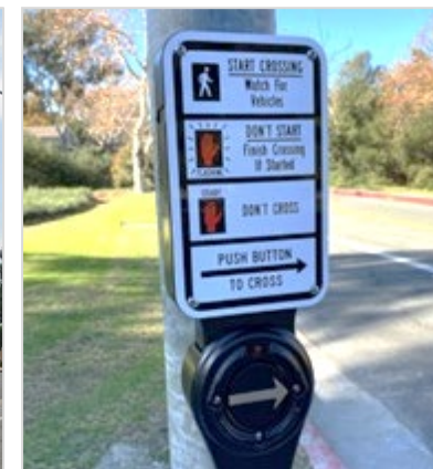
Marguerite Parkway City of Mission Viejo