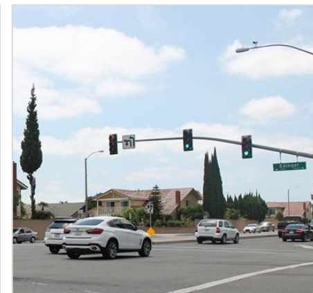
Edinger Avenue City of Fountain Valley