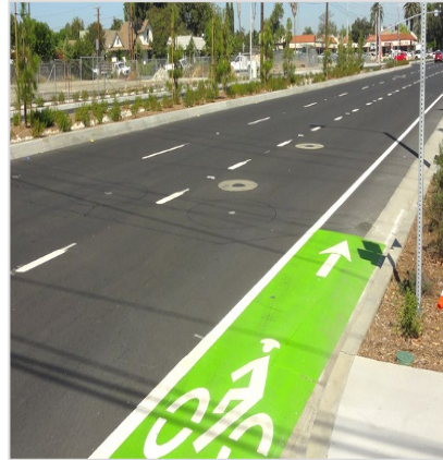
Grand Avenue Improvements City of Santa Ana