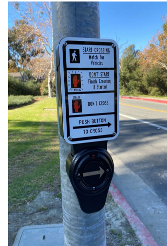
Marguerite Parkway City of Mission Viejo