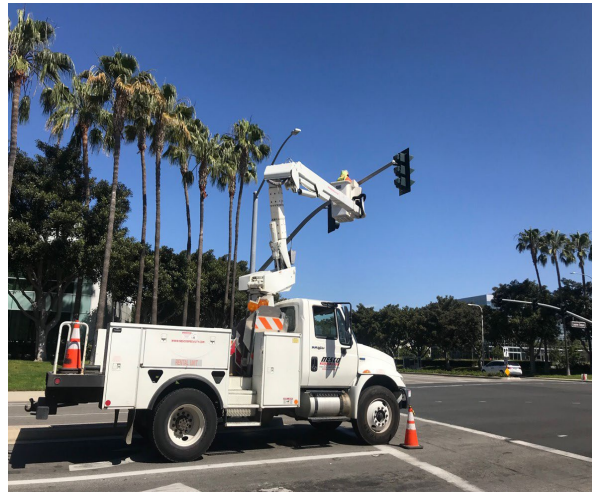
Irvine Center Drive / Edinger Avenue City of Irvine