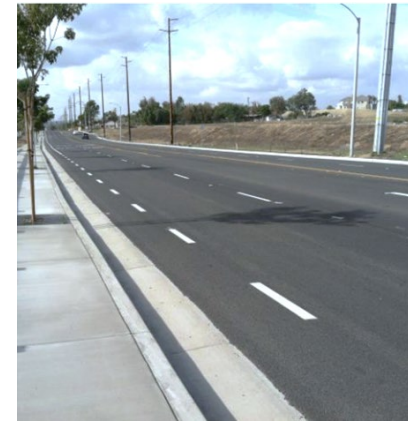
Bastanchury Road Improvements City of Yorba Linda