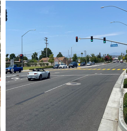
Brookhurst Street Improvements City of Anaheim