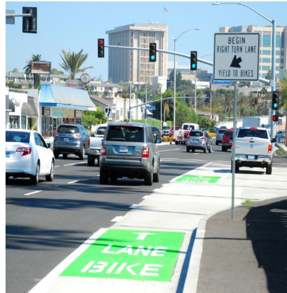
Newport Boulevard Improvements City of Newport Beach