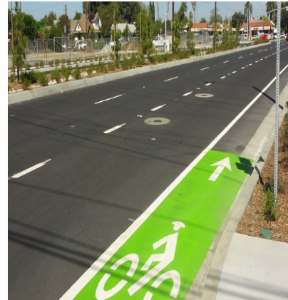
Grand Avenue Improvements City of Santa Ana