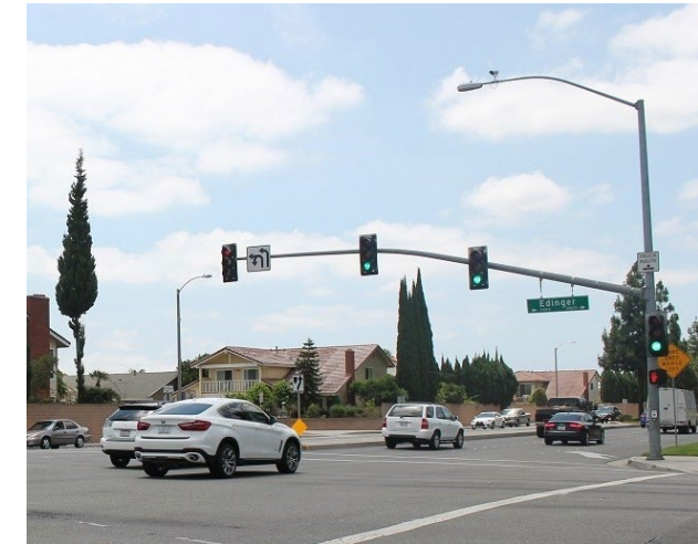
Edinger Avenue City of Fountain Valley