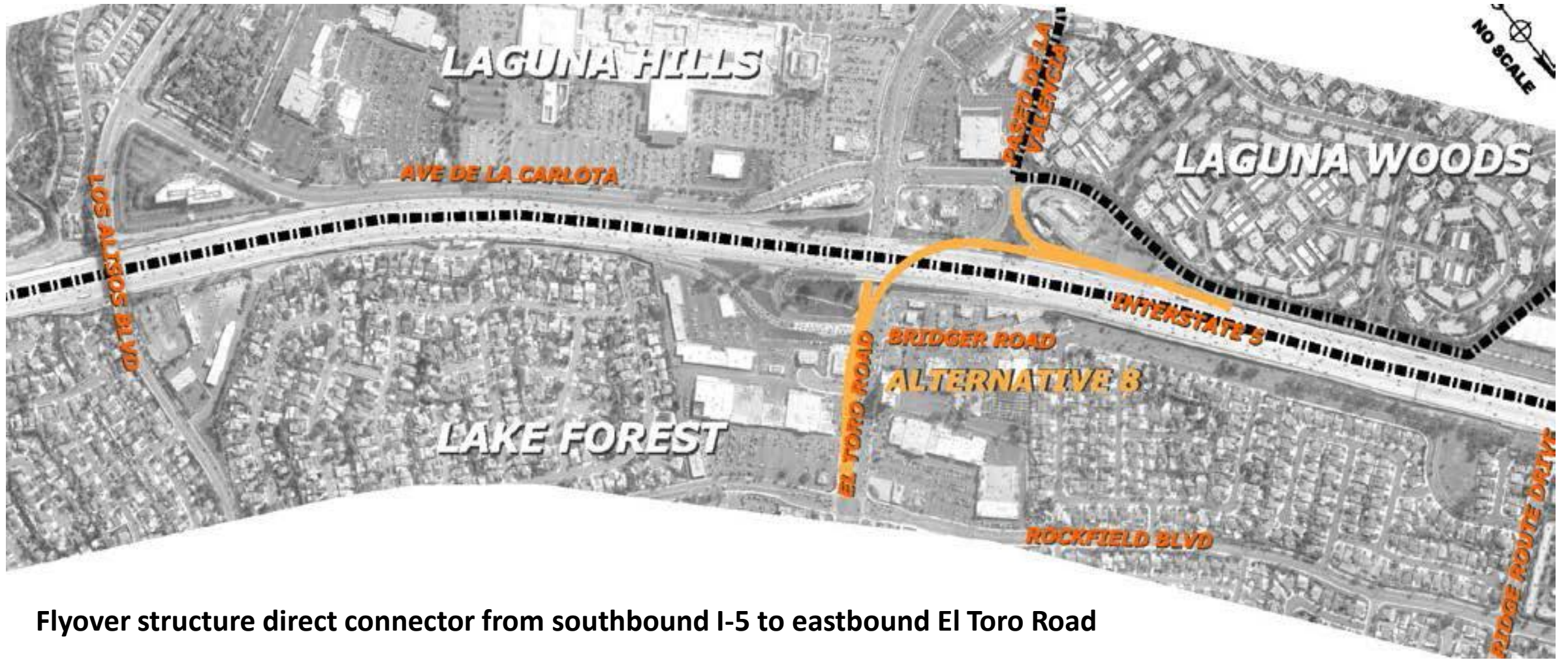
Flyover structure direct connector from southbound I-5 to eastbound El Toro Road