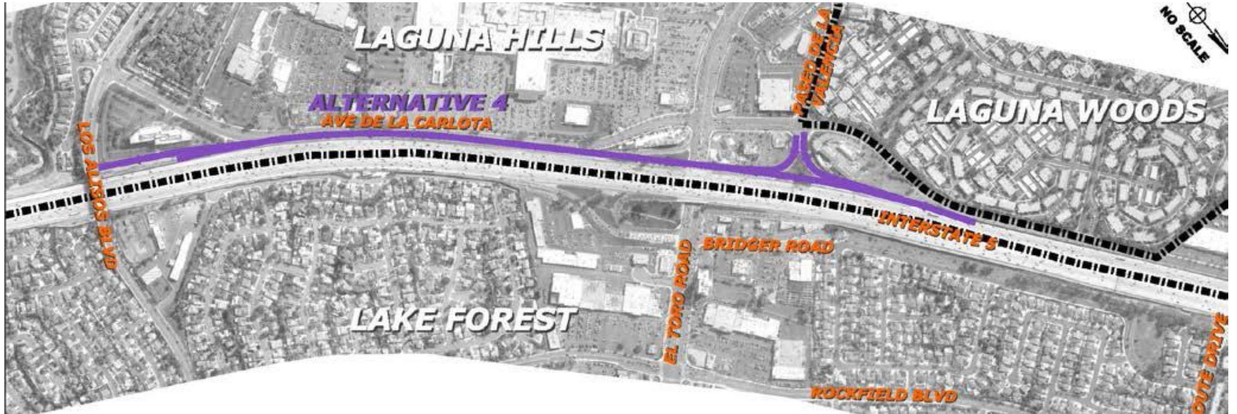
Southbound collector/distributor system from El Toro off-ramp to new Los Alisos Boulevard off-ramp