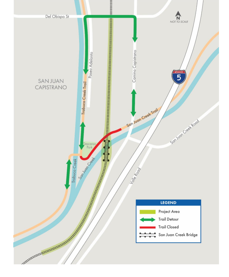
Click on map to enlarge.