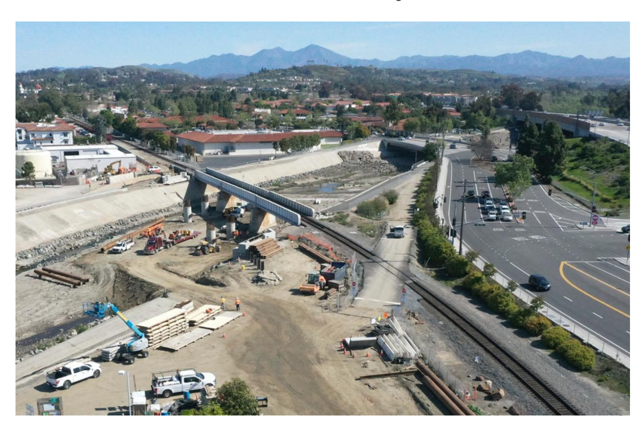
Construction activities in San Juan Creek.