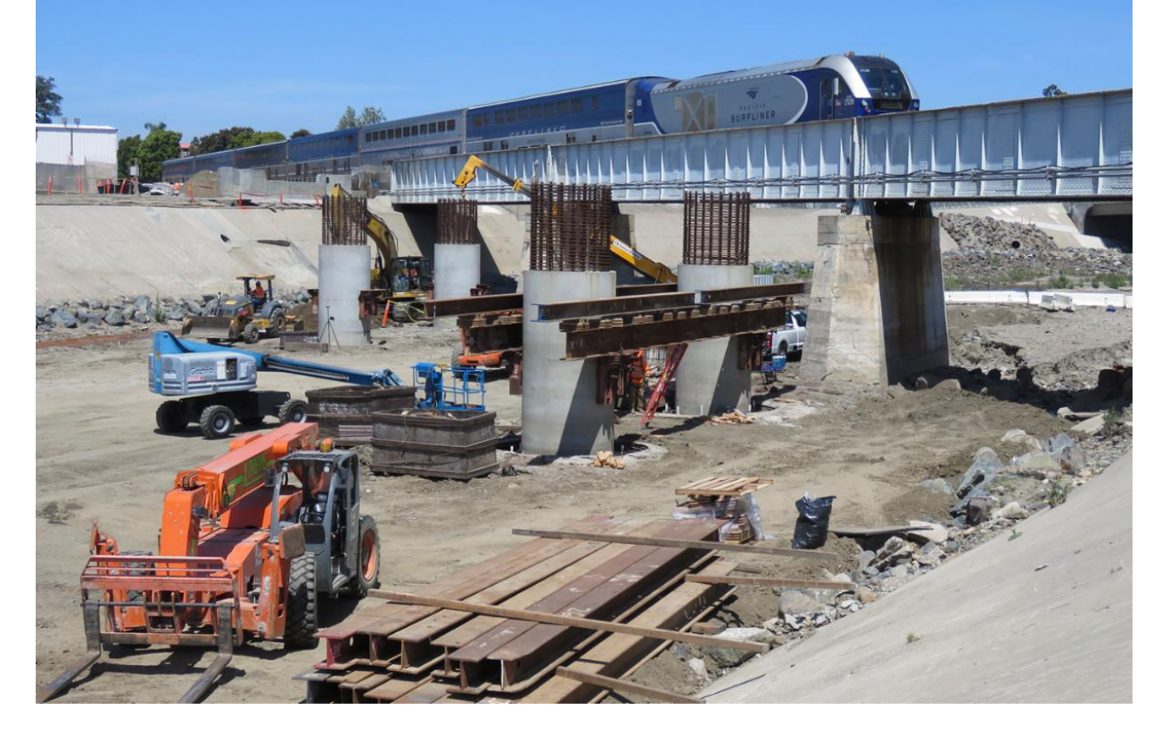
Crews resumed work on the new bridge foundation.