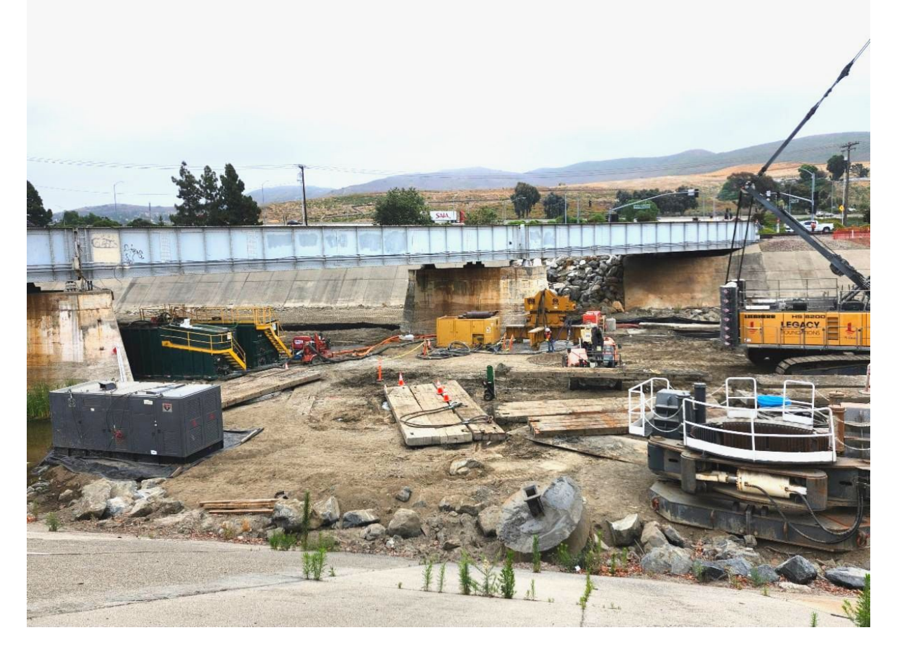
Bridge foundation work within San Juan Creek.