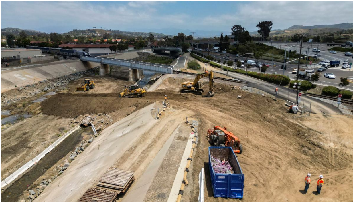
Contractors grading a temporary access ramp into the creek.