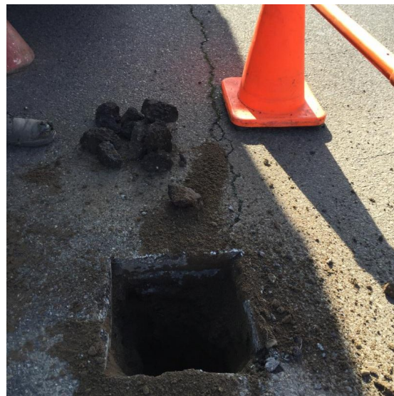
Examples of potholing activities