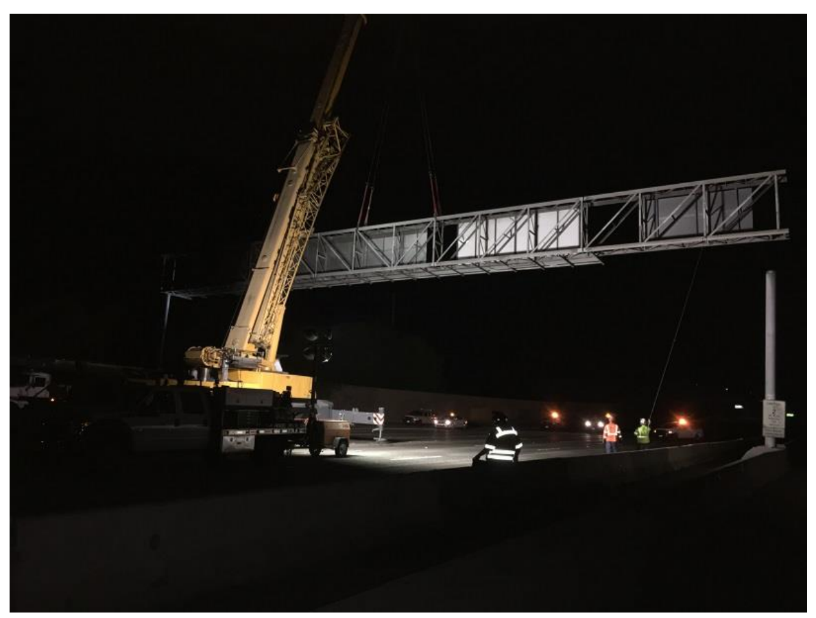
Overhead sign removal