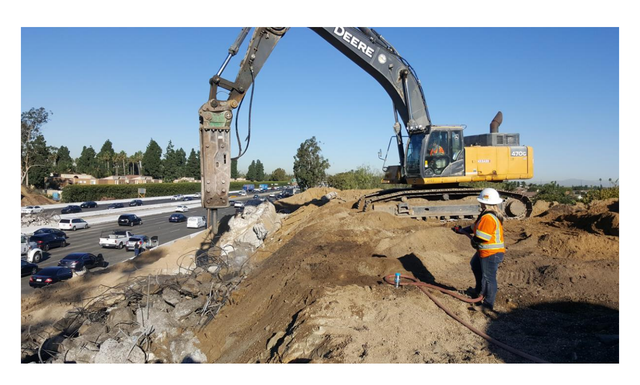
Slater Avenue full bridge demolition – September 2018