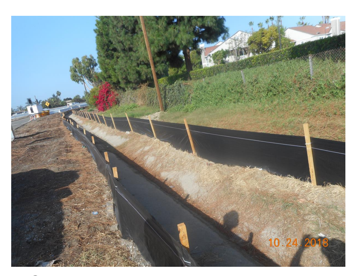
Storm water treatment measures