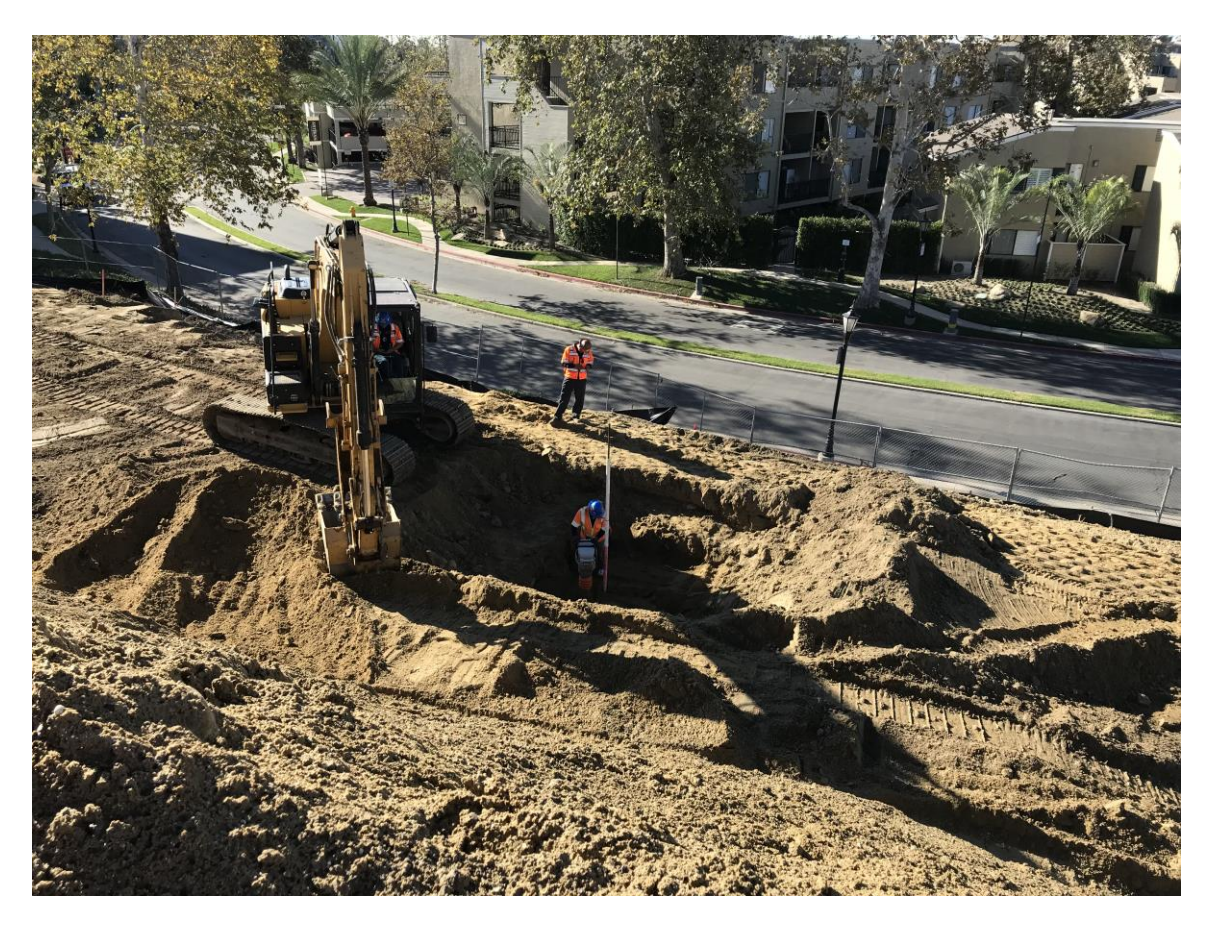
Goldenwest and McFadden embankments