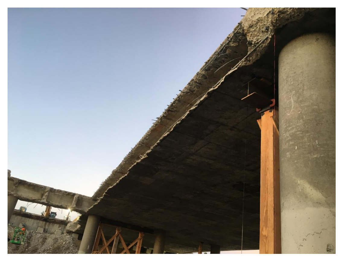
Bolsa Chica Road partial bridge demolition – December 2018