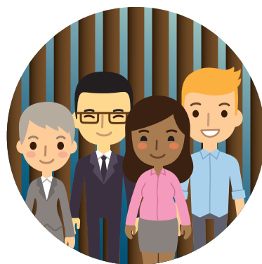
Attract and Retain a Diverse and Engaged Workforce