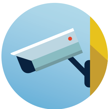
Enhance Security and Safety Measures