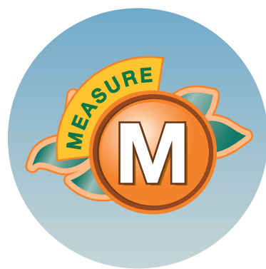
Deliver on the Promise of Measure M