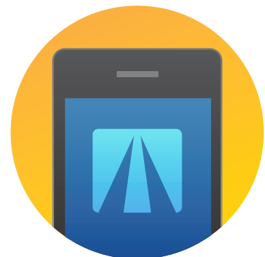
Leverage Technology to Improve Business Operations