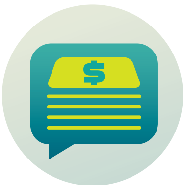
Preserve Fiscal Stability through Prudent Financial Planning