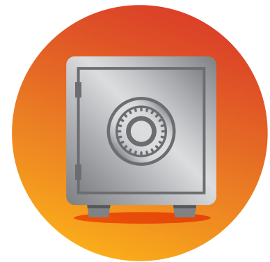
Safeguard Public Investments in Transportation