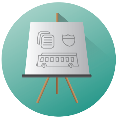
Educate Customers on Upcoming Programs