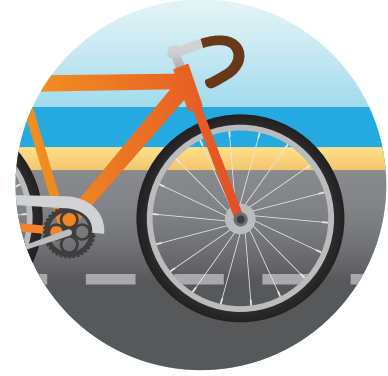
Expand Active Transportation