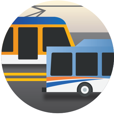
Advance Capital Projects