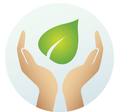
Protect Environmental Resources