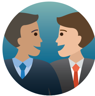
Maintain Open Communication with Stakeholders