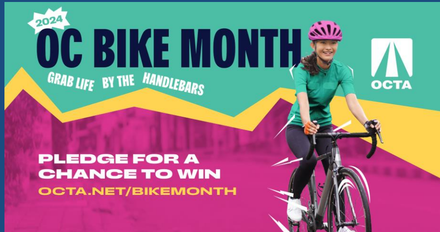
Facebook Pledge Ad