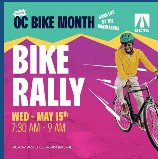
Facebook Rally Ad