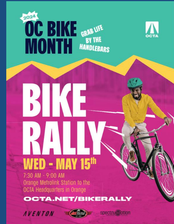
Bike Rally Flyer