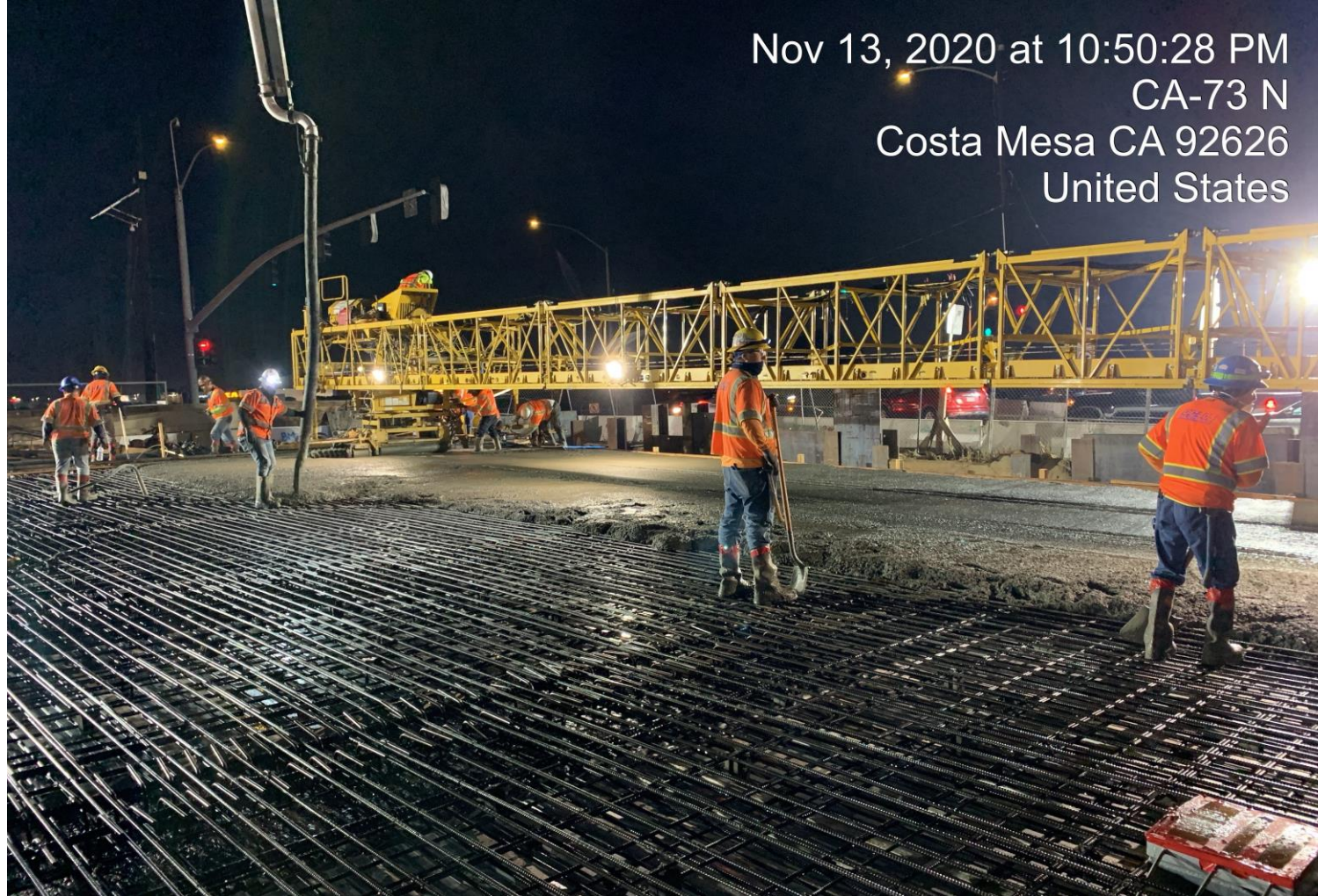
Fairview Road bridge construction