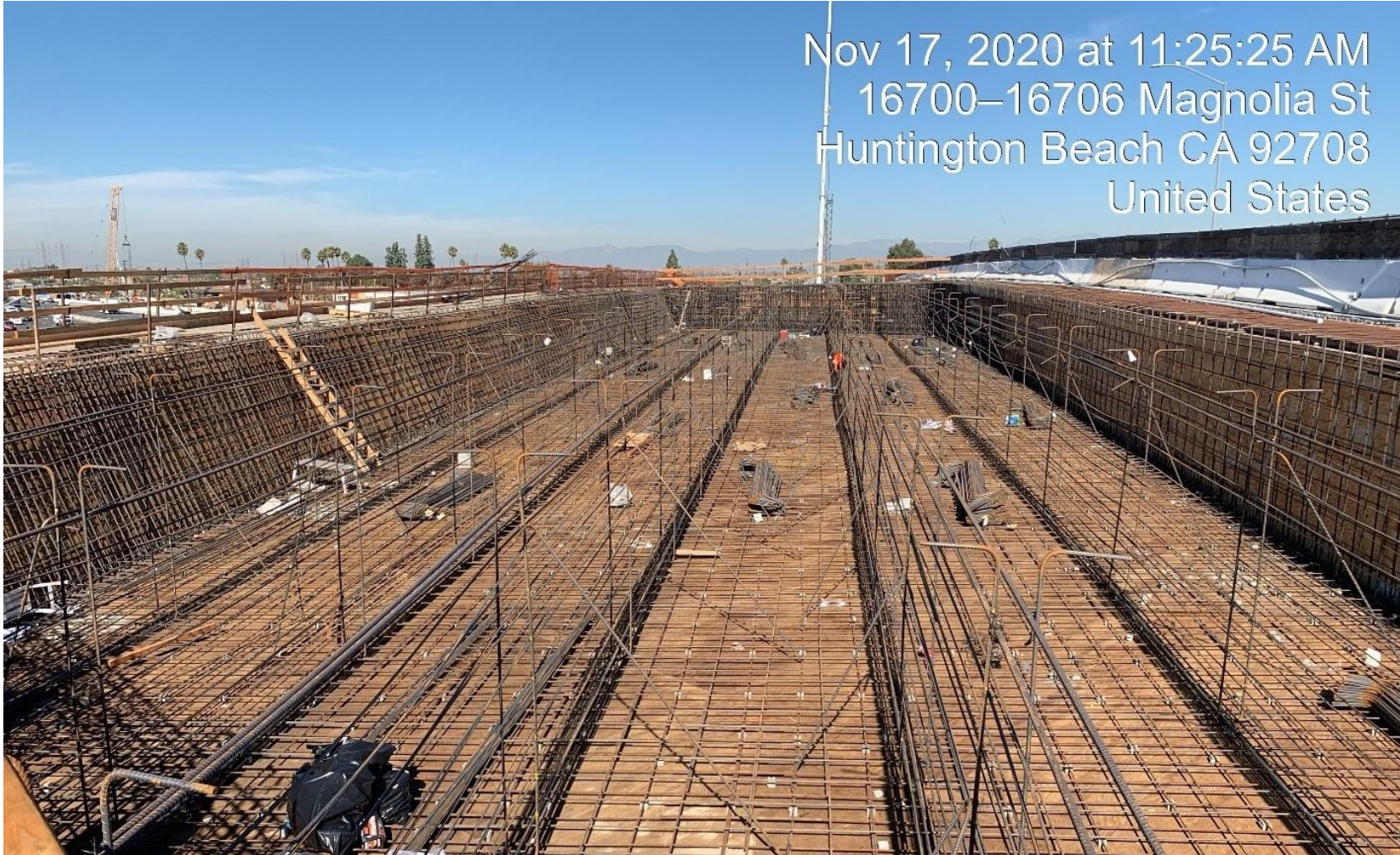
Magnolia Street bridge construction