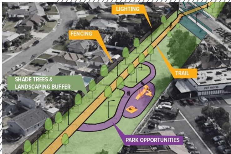
Wide Section Tailside Element Concept