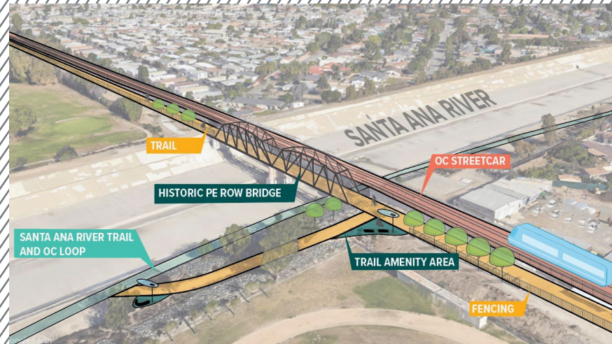
Bridge/Santa Ana River Trail Concept