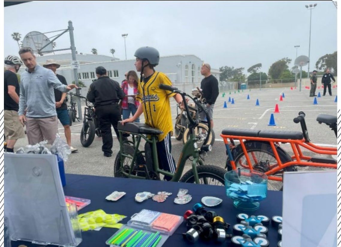
VoltVerified E-bike Rodeo Pop-Up in Huntington Beach