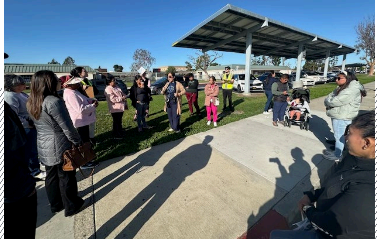
Walk Audit at Sycamore Magnet Academy in Tustin