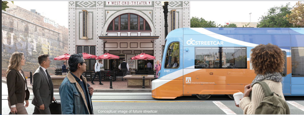
Conceptual image of future streetcar