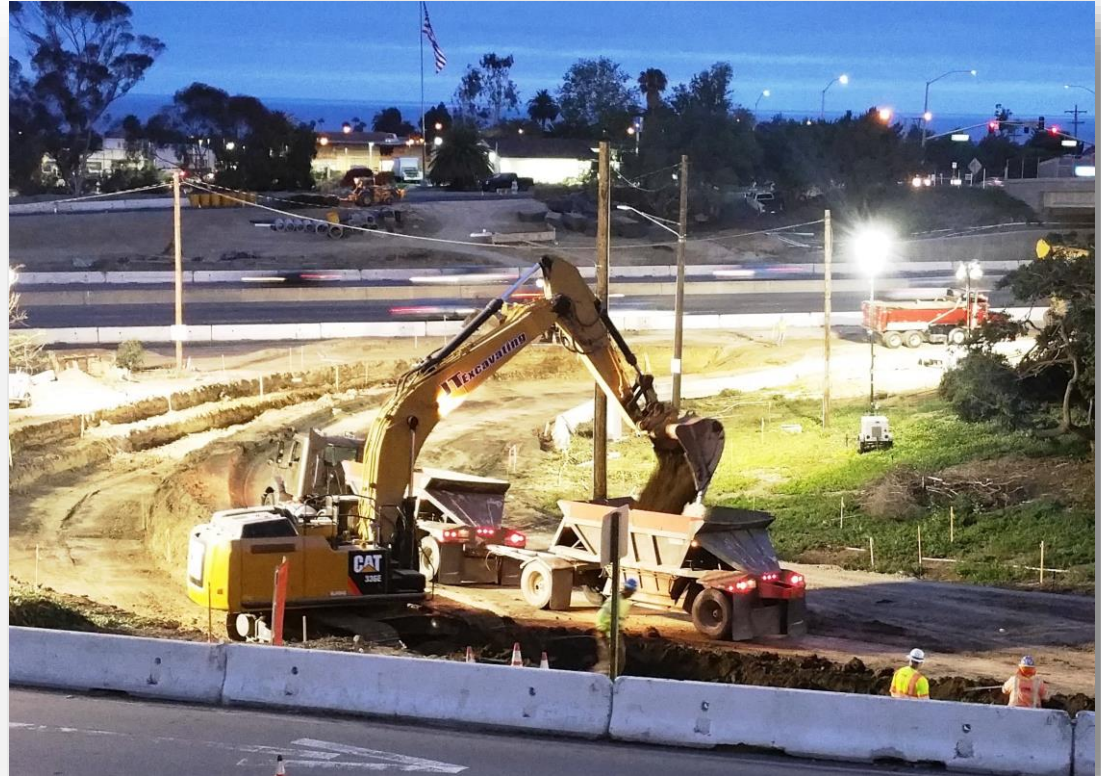
Crews work to reconstruct the loop on-ramp from Camino de Estrella to northbound I-5.