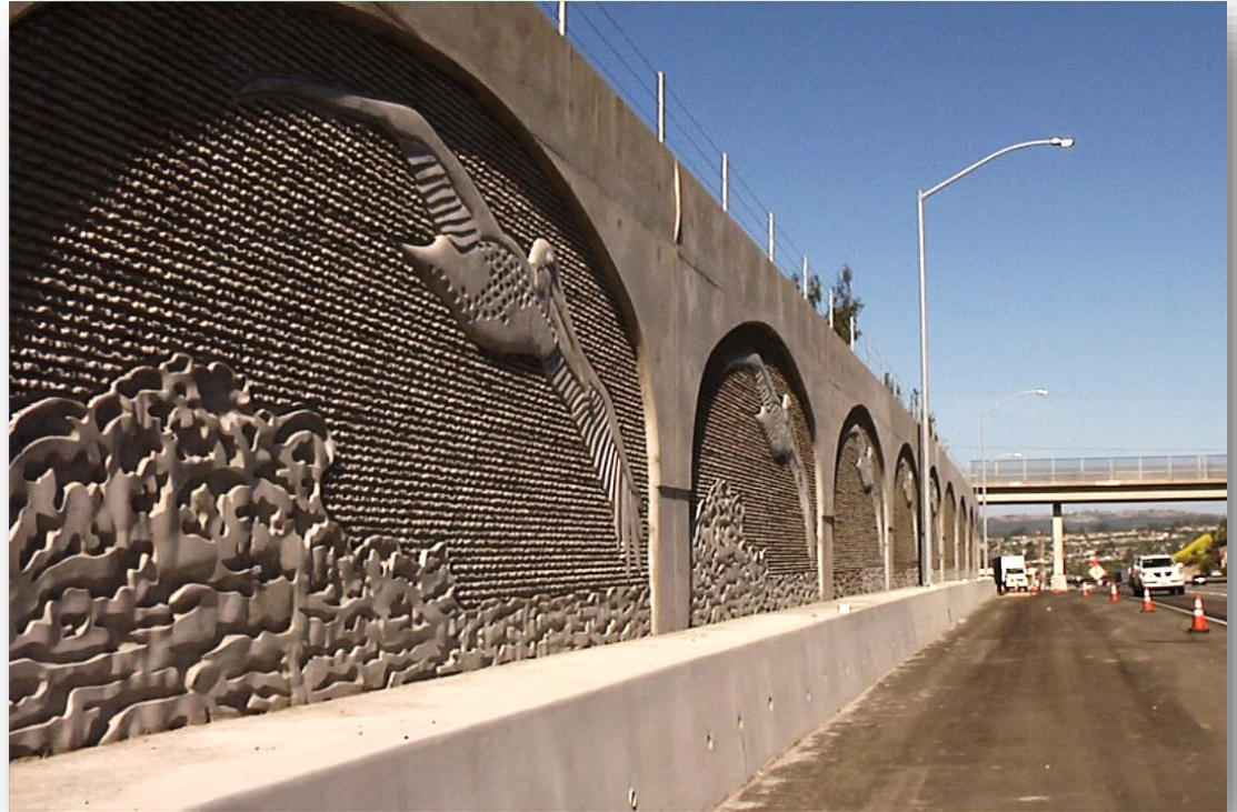
The new retaining wall along southbound I-5, south of PCH / Camino Las Ramblas.