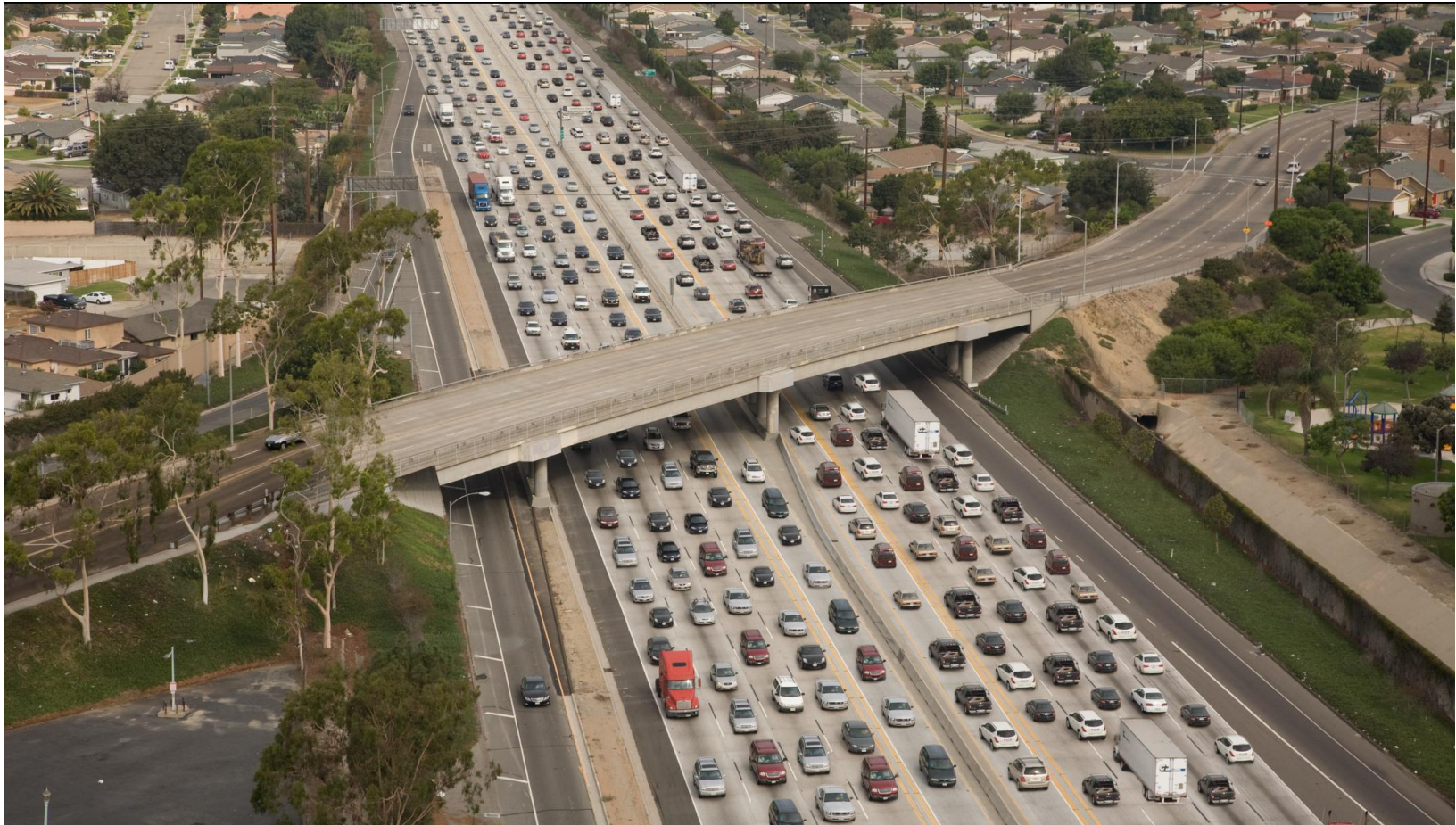
Rendering of I-405 looking northwest at Springdale St. overcrossing