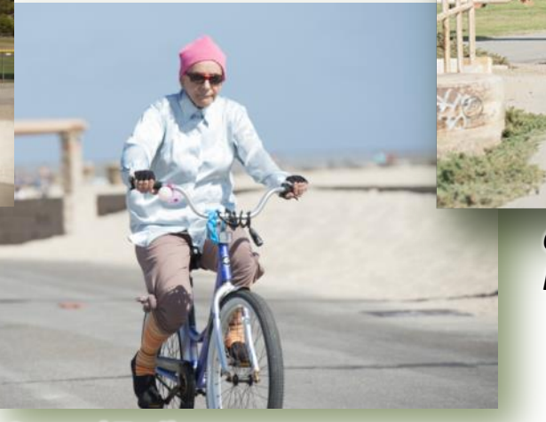
Coastal Trail Huntington Beach