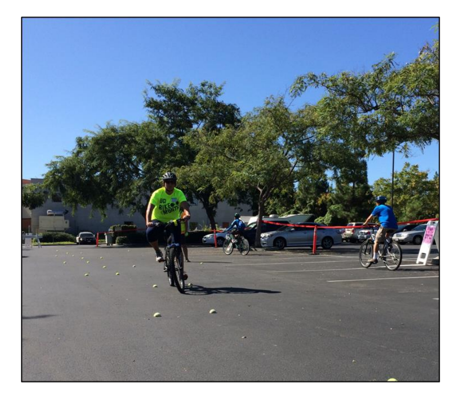
University of California, Irvine Bicycle Month Skills Course