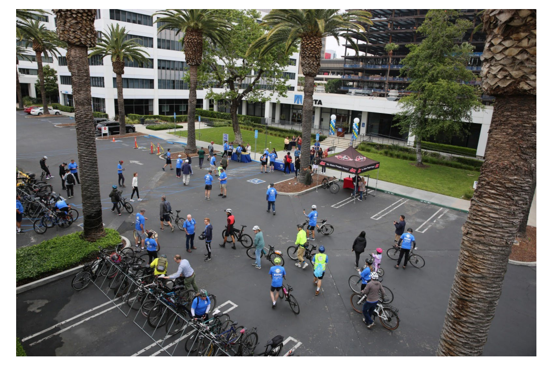
Citizens Advisory Committee April 16, 2024