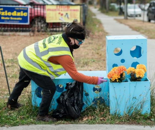
Minneapolis, Mobility Hubs