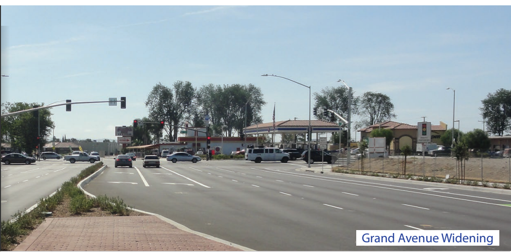
Grand Avenue Widening