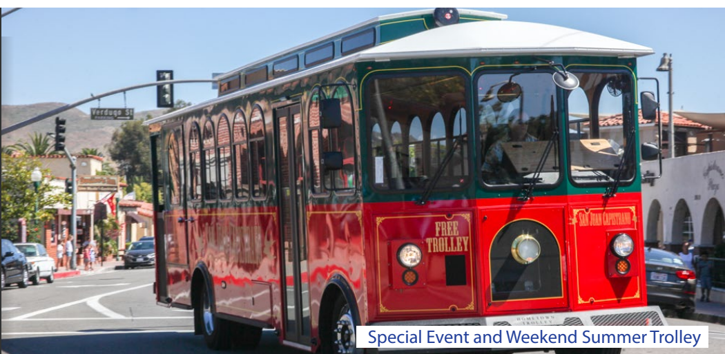
Special Event and Weekend Summer Trolley