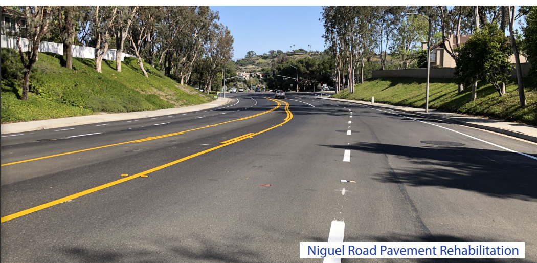
Niguel Road Pavement Rehabilitation