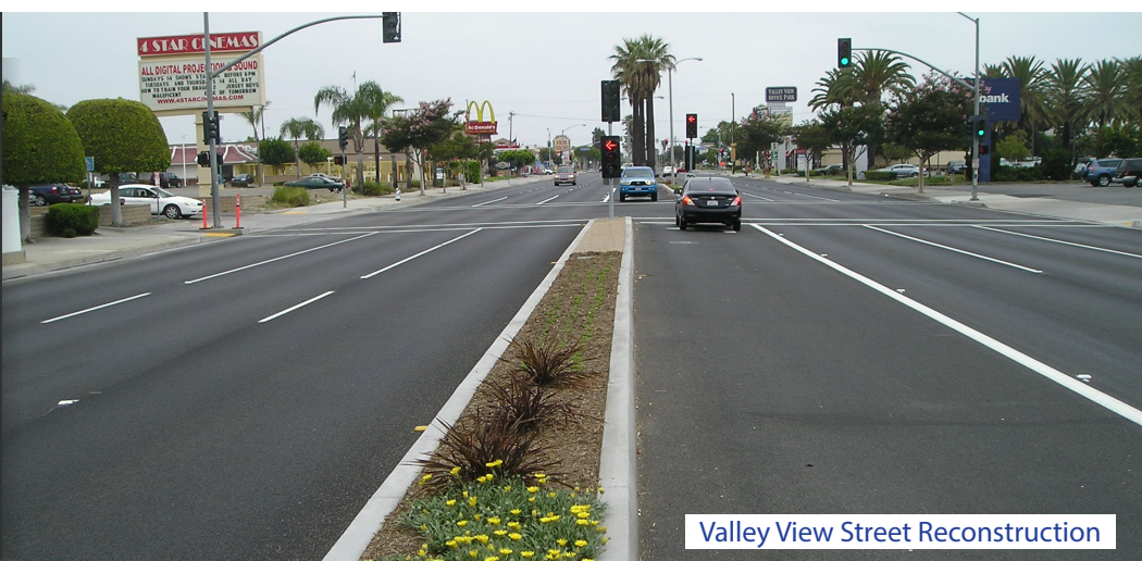
Valley View Street Reconstruction