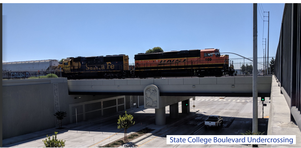
State College Boulevard Undercrossing