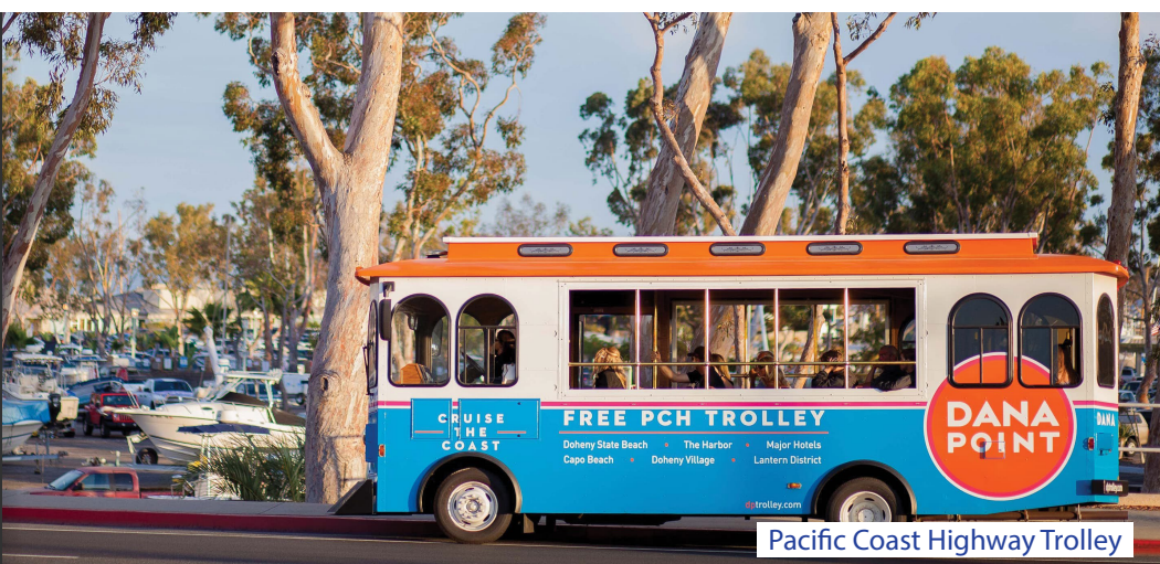
Pacific Coast Highway Trolley